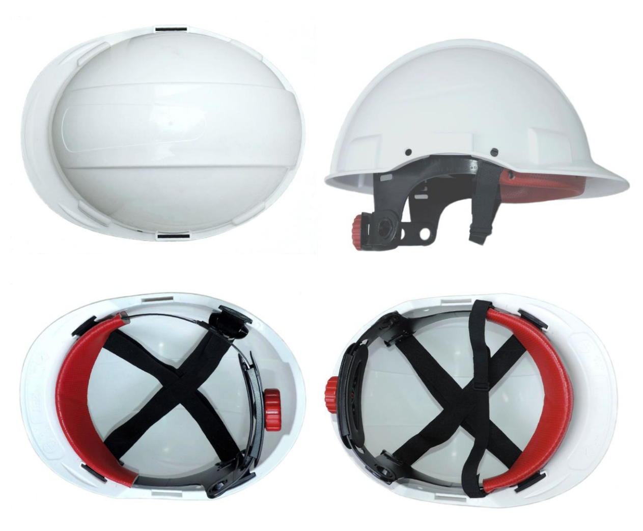
CNG 500 (without chin strap)